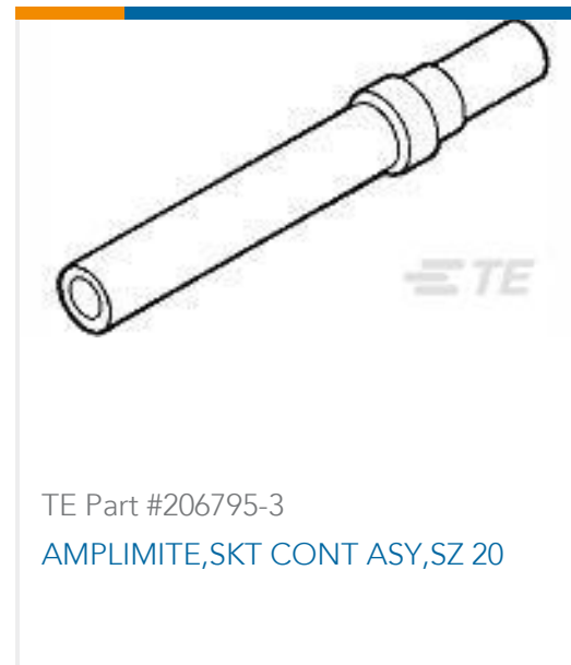
TE Part #206795-3 AMPLIMITE,SKT CONT ASY,SZ 20