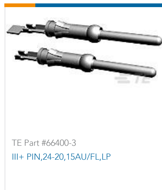
TE Part #66400-3 III+ PIN,24-20,15AU/FL,LP