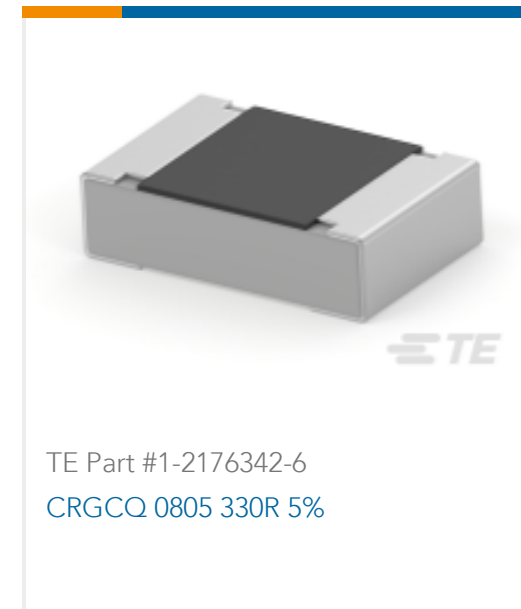
TE Part #1-2176342-6 CRGCQ 0805 330R 5%