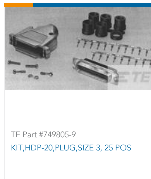
TE Part #749805-9 KIT,HDP-20,PLUG,SIZE 3, 25 POS