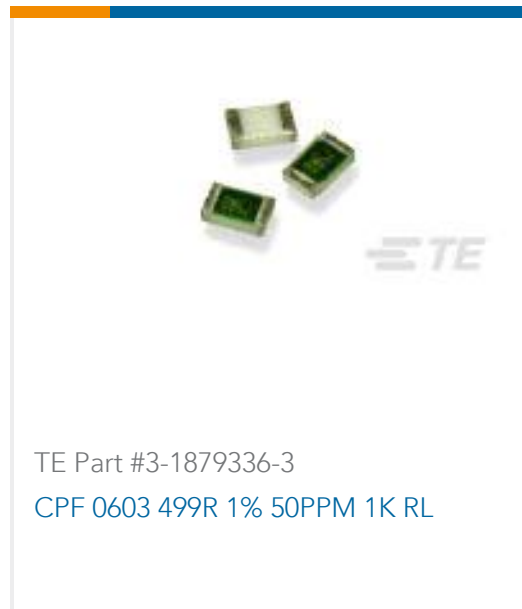
TE Part #3-1879336-3 CPF 0603 499R 1% 50PPM 1K RL