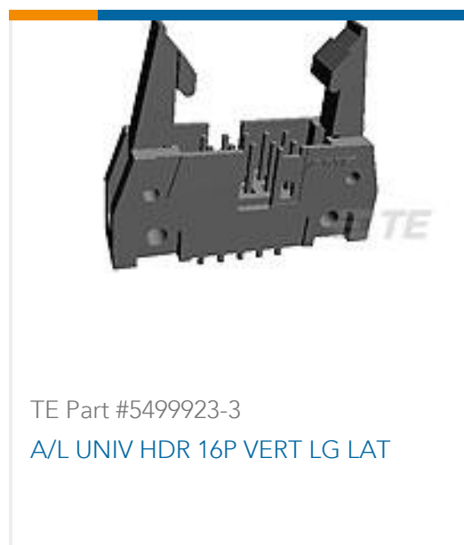
TE Part #5499923-3 A/L UNIV HDR 16P VERT LG LAT