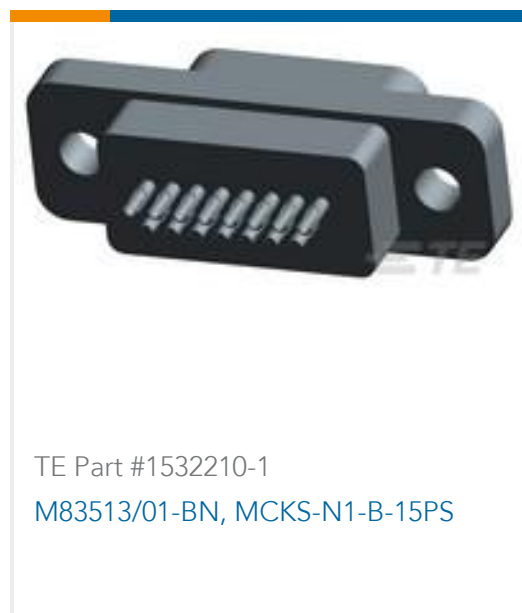
TE Part #1532210-1 M83513/01-BN, MCKS-N1-B-15PS