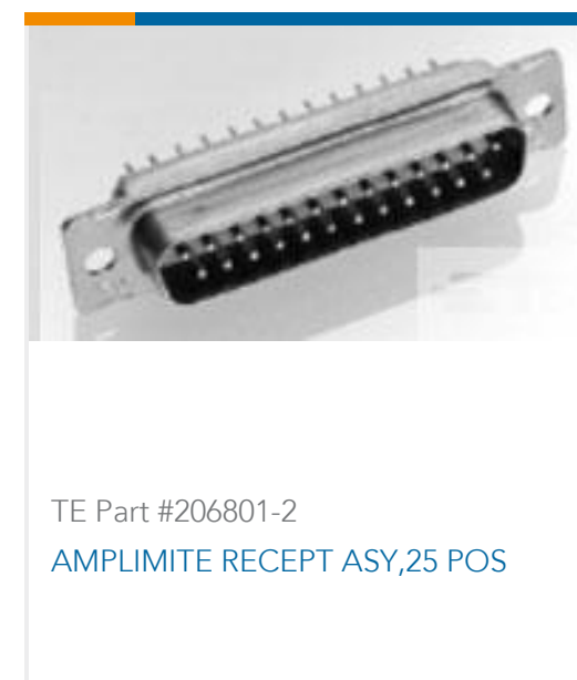
TE Part #206801-2 AMPLIMITE RECEPT ASY,25 POS