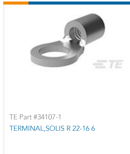
TE Part #34107-1 TERMINAL,SOLIS R 22-16 6