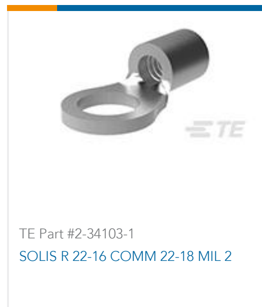
TE Part #2-34103-1 SOLIS R 22-16 COMM 22-18 MIL 2