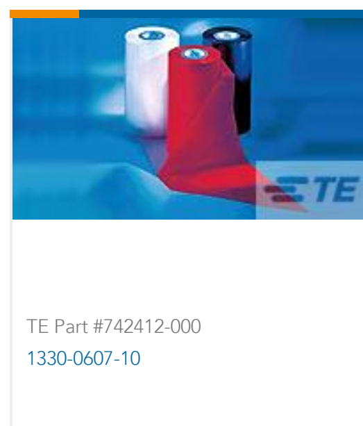
TE Part #742412-000 1330-0607-10