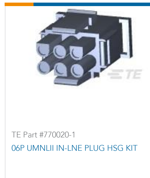
TE Part #770020-1 06P UMNLII IN-LNE PLUG HSG KIT