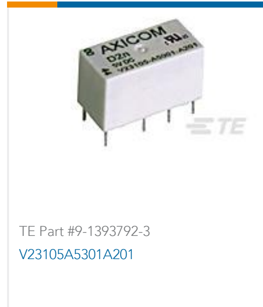
TE Part #9-1393792-3 V23105A5301A201