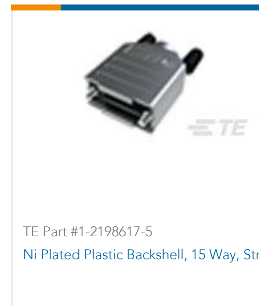
TE Part #1-2198617-5 Ni Plated Plastic Backshell, 15 Way, Str