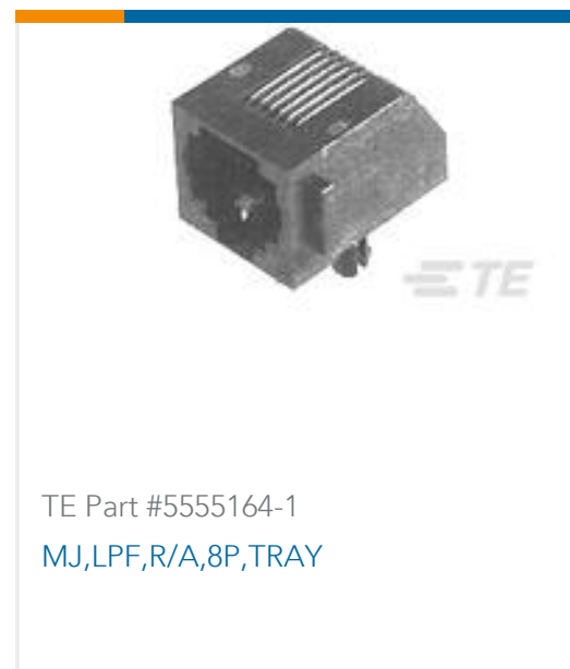
TE Part #5555164-1 MJ, LPF, R/A, 8P, TRAY