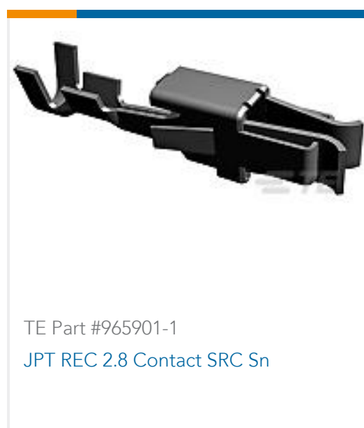
TE Part #965901-1 JPT REC 2.8 Contact SRC Sn