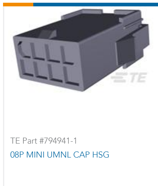
TE Part #794941-1 08P MINI UMNL CAP HSG