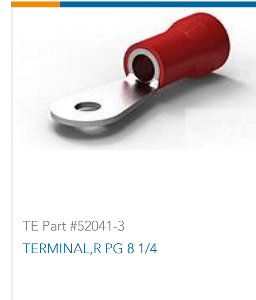
TE Part #52041-3 TERMINAL, R PG 8 1/4