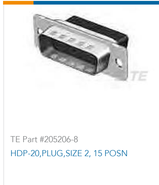
TE Part #205206-8 HDP-20, PLUG, SIZE 2, 15 POSN