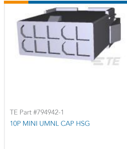
TE Part #794942-1 10P MINI UMNL CAP HSG