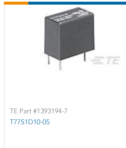
TE Part #1393194-7 T77S1D10-05