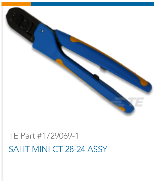
TE Part #1729069-1 SAHT MINI CT 28-24 ASSY