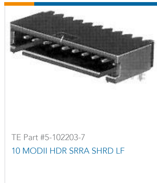
TE Part #5-102203-7 10 MODII HDR SRRA SHRD LF