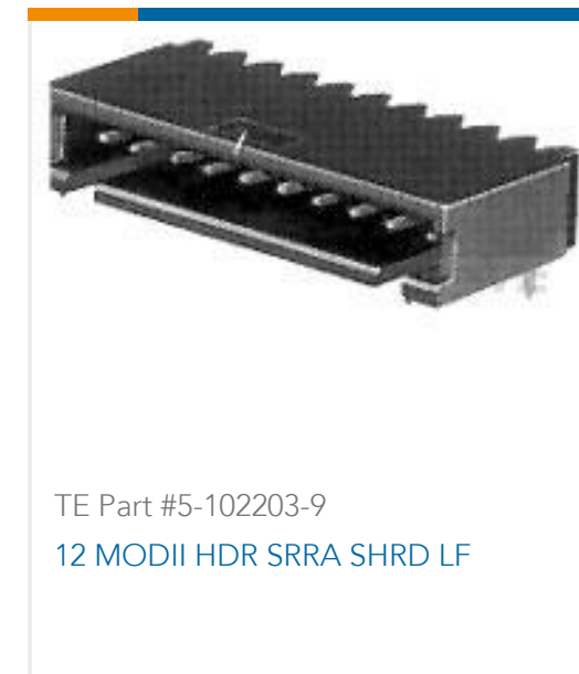
TE Part #5-102203-9 12 MODII HDR SRRA SHRD LF