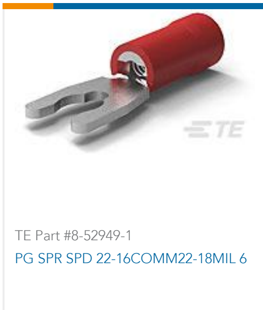
TE Part #8-52949-1 PG SPR SPD 22-16COMM22-18MIL 6