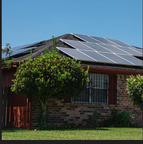
SOLAR PANELS MONITORING & CONTROL