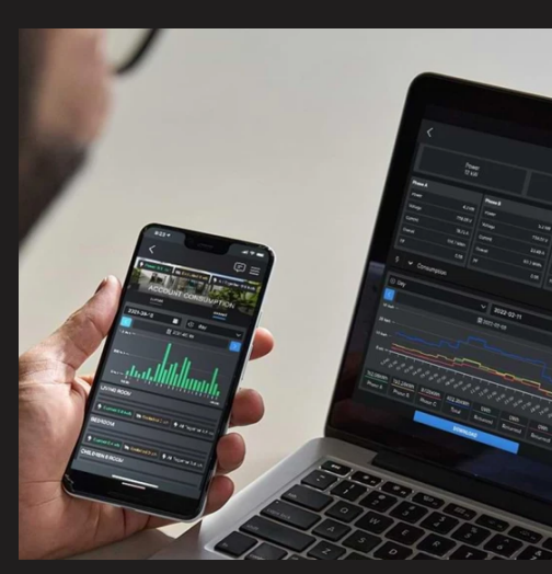
2-WAY CONSUMPTION MONITORING