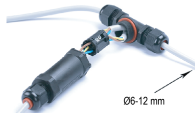
Strip cables, wire length 6.5 cm (±0.5 cm).