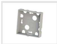
Back part for surface wiring 200.004