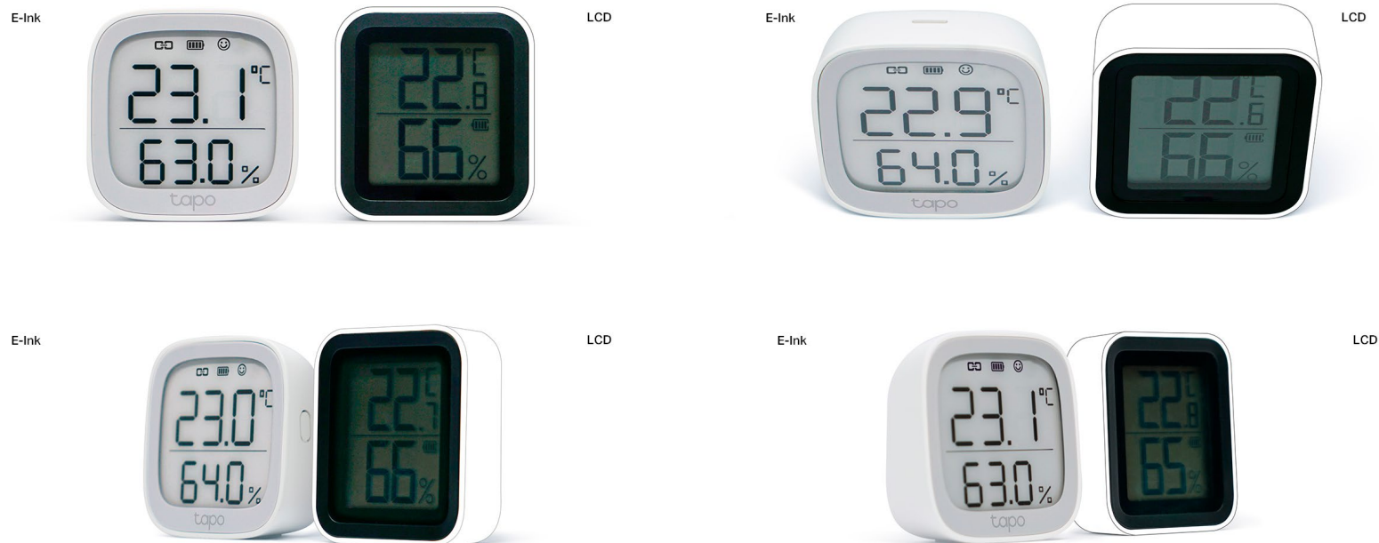
Comparison between an E-ink display and a backlit display.

Features a 2.7" E-ink display that reads like real paper. No screen glare and daylight readable with a 180 degree viewing angle.