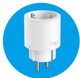
Tapo Smart Plug