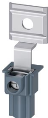
CONTROL WIRE TAP FOR BOX TERMINAL ACCESSORY FOR: 3VA2 100/160/250 3VA1 250 PLUG-IN / DRAW-OUT