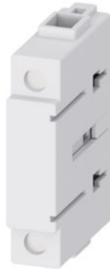
N-through terminal, Front installation, accessory for Load disconnecter 3LD3