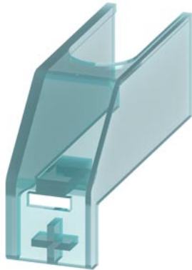
Terminal cover, for 1-pole, Accessories for load disconnecter 3LD3