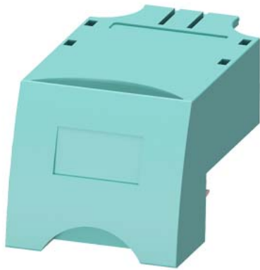
Cable connector size S00 Spring-type terminal