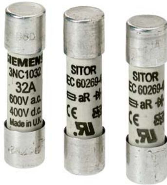
SITOR cylindrical fuse link, 14x51 mm, 6 A, aR, Un AC: 690 V, Un DC: 700 V, DC according to UL