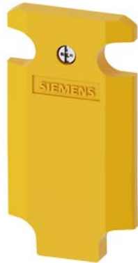
Cover yellow for position switch metal 3SE51, enclosure, according to EN 50041