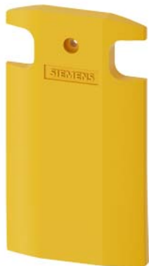
Cover yellow for position switch metal XL, 56 mm wide