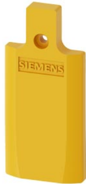
Cover for position switch Plastic 3SE52, for Enclosure according to EN 50047, 31 mm Color yellow