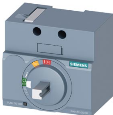
rotary operator with shaft stub for 8UC retrofit accessory for: 3VA5 125