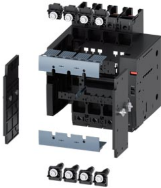
draw-out unit complete kit accessory for: circuit breaker, 4-pole 3VA6 150/250