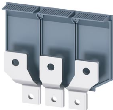
FRONT BUS CONNECTORS OFFSET 3 PCS ACCESSORY FOR: 3VA5/6 400/600