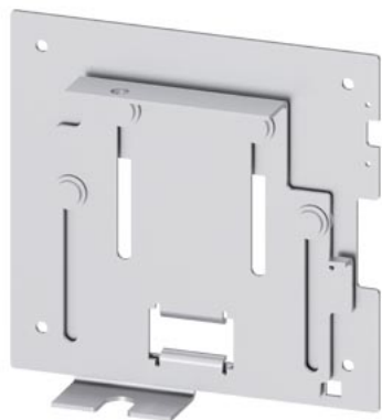
Operating Unit w/ Bowdencable Max-Flex Operator Switching mechanism only accessory for: 3VA55/65/66