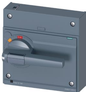
Front mounted rotary operator standard IEC IP30/40 accessory for: 3VA55/3VA65/3VA66