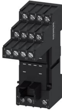
Plug-in socket for PT relay 4 changeover contacts with logic isolation screw terminal