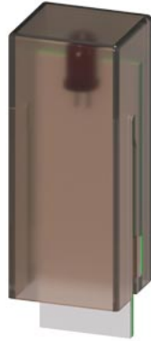
LED module, red for plug-in relay, PT and RT series, for DC 24 V with freewheeling diode