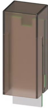
RC element, 24-48 V AC