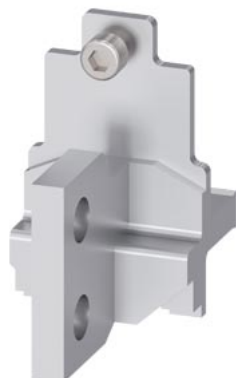
Accessory Circuit breaker 3WA, Rear vertical main-connection, top or bottom, frame size 1 - up to 1000 A for circuit breaker in withdrawable design, 1 piece