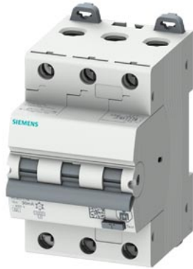
RCBO, 6 kA, 3P Type A, 300mA, B-Char, In: 16A Un: 400V