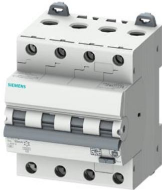
RCBO, 6 kA, 4P Type A, 300mA, C-Char, In: 16A Un: 400V