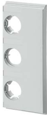
Touch protection cover ISO for bus-mounting fuse base 3-pole for busbar system 60 mm D02/63A 1.33-fold