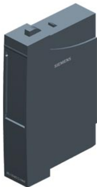
SIMATIC ET 200SP HA, 5 TM covers, 22.5 mm, for protection of I/O empty slots