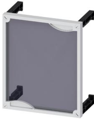
Front cover with inspection window H=300 mm, W=250 mm