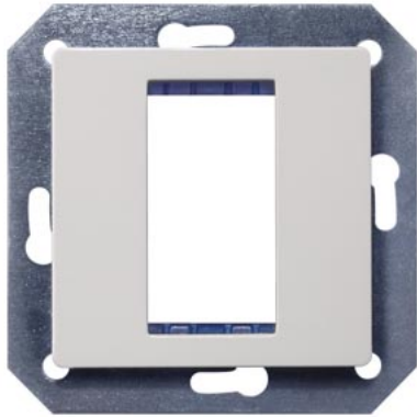
DELTA i-system titanium white Module rack, 1 x incl. intermediate frame Screw mounting