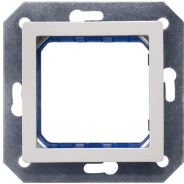
DELTA i-system titanium white Module rack, double incl. intermediate frame Screw mounting