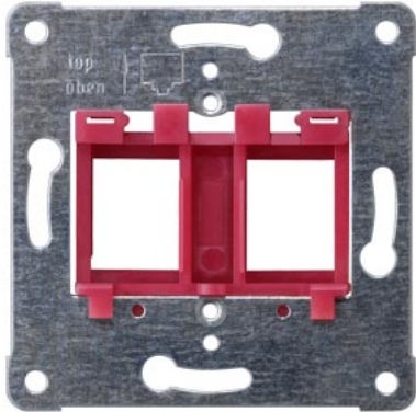
Support plate red insert for accommodating up to 2 modular jack connectors Screw mounting PEHA design. MJ1