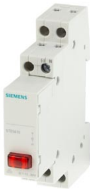
Light Indicator 1x LED 12..60V red