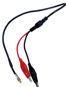
Crocodile clip cable OSCILLOSCOPE / SIGNAL GENERATOR