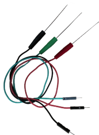
3x SMD test probe COMPONENT TESTER