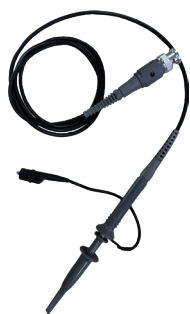
Probe OSCILLOSCOPE / SIGNAL GENERATOR