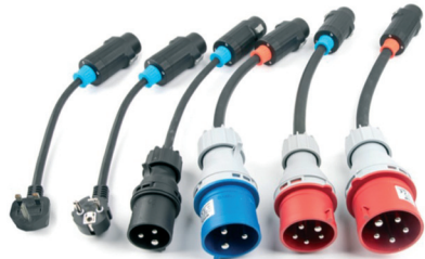
UK 13A Single-phase Schuko 16A Single-phase CEE 16A Single-phase CEE 32A Single-phase CEE 16A Three-phase CEE 32A Three-phase