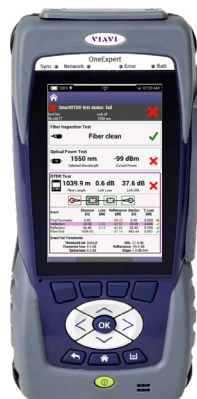
OneCheck Fiber Result view on ONX