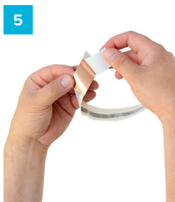
Peel back to reveal copper foil layer at the other end.