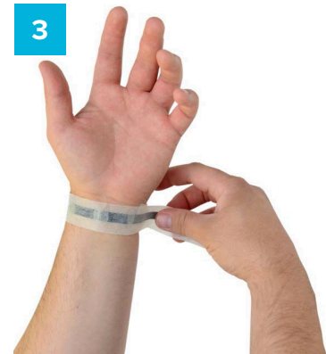
Place the tacky side on wrist.