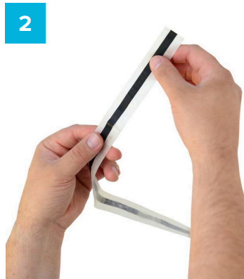
Peel back to reveal adhesive layer.