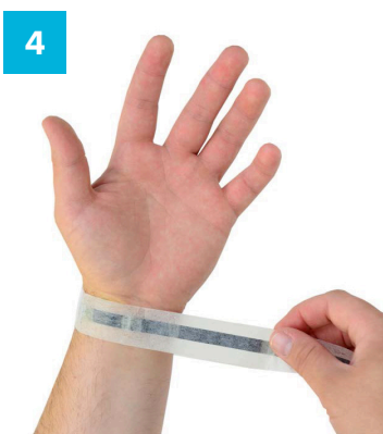
Ensure wrist is covered and the black conductive strip is against the skin.