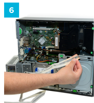
Fix the copper foil to your grounding point.

To request a quotation or for more information, please call +44 (0)1473 836200 email info@antistat.co.uk or visit www.antistat.co.uk