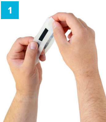
Remove wrist strap from external packaging.