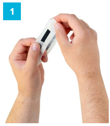
Remove wrist strap from external packaging.