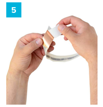
Peel back to reveal copper foil layer at the other end.