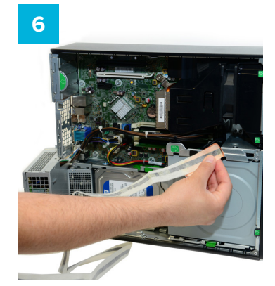
Fix the copper foil to your grounding point.