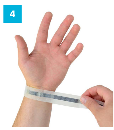
Ensure wrist is covered and the black conductive strip is against the skin.