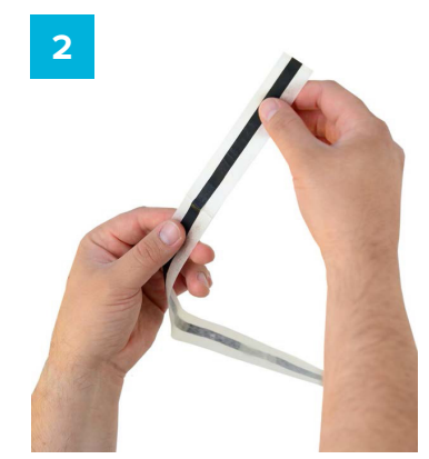
Peel back to reveal adhesive layer.