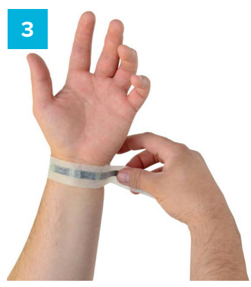
Place the tacky side on wrist.