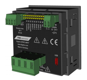
USB Galvanically isolated supply 5 V