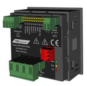
Modbus 3 x 3,5 mm RS485