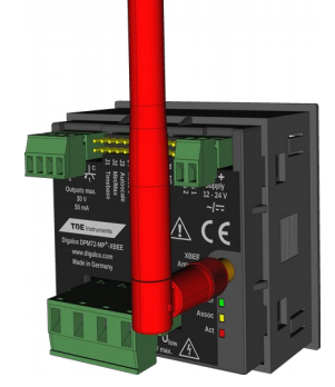
XBEE Wireless transmission via 2,4 GHz mesh network