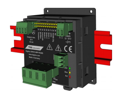
Without display Mounting on DIN rail for XBEE and Modbus