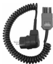
WS-05 adapter (UNI-SCHUKO angular plug)