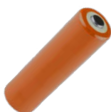
4x LR6 1.5 V battery