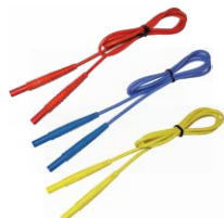
Test lead 1.2 m (banana plugs) red / blue / yellow