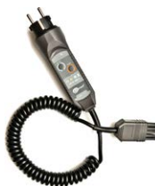
WS-03 adapter with START button (UNI-Schuko plug)