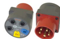
Three-phase socket adapter 16 A / 32 A