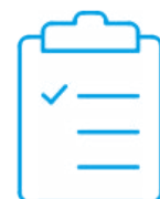
Calibration certificate with accreditation