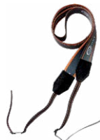
M1 hanging straps