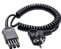
WS-04 adapter (UNI-SCHUKO angular plug)