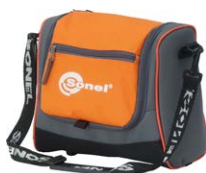
M6 carrying case