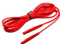
Test lead for fault loop measurement (banana plugs) 5 m / 10 m / 20 m