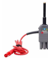
WS-07 adapter for measuring Z(L-N) loop