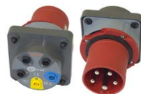
Three-phase socket adapter 63 A