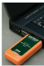
BRD10 - Optional Wireless USB Video Receiver allows user to stream live video to a PC and also can be remotely viewed via VOIP connection