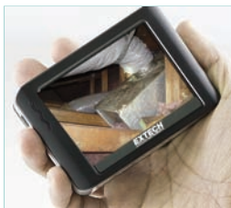
Detachable wireless 3.5" color TFT LCD display can be viewed from a remote location up to 32ft (10m) from the measurement point.

Complete with 4 AA batteries, rechargeable display battery, microSD memory card with SD adaptor, USB cable, extension tools (mirror, hook, magnet) video interconnect cable, AC adaptor (100-240V, 50/60Hz), magnetic base stand, and hard case