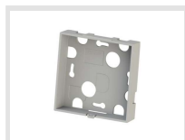
Back part for surface wiring 200.004