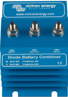
Argo Diode Battery Combiner BCD 802

Diode Battery Combiners are used to guarantee continuous DC power to mission critical equipment, such as an electronic engine control system. With a diode battery combiner two or more DC power sources can be used in parallel to supply the mission critical load. Failure of one source will not interrupt power to the critical load.