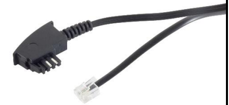
WESTERN 6/4 PLUG