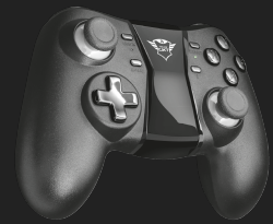
PRODUCT VISUAL 3