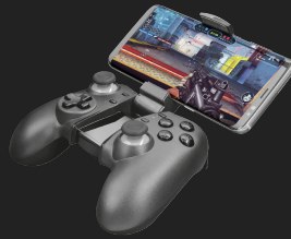
PRODUCT VISUAL 2