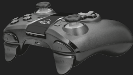
PRODUCT VISUAL 4