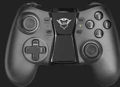
PRODUCT TOP 1