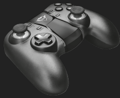
PRODUCT VISUAL 1