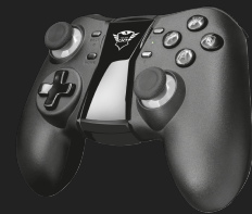
PRODUCT EXTRA 1