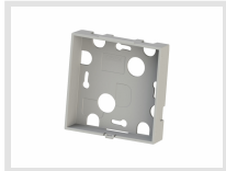
Back part for surface wiring 200.004