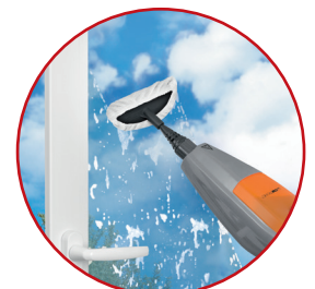
Fleece attachment for thorough cleaning