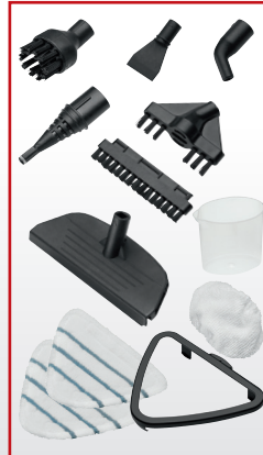
Accessories: 2x microfiber cloth, measuring cup, window cleaner, nozzle, brush, carpet glider attachment