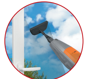
Window cleaning attachment, cleans without streaks and limescale residue