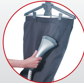
Gentle and effective method for removing creases from fabrics