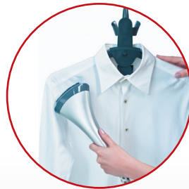
Vertical steam ironing for hanging clothes

Gentle and effective method for removing creases from fabrics