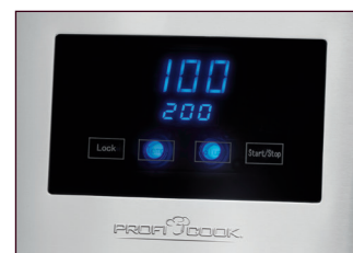
LED display / Sensor touch operation