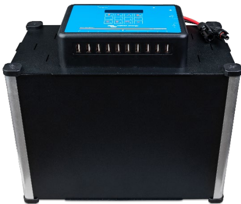
SHS 200 – mounted on optional battery box